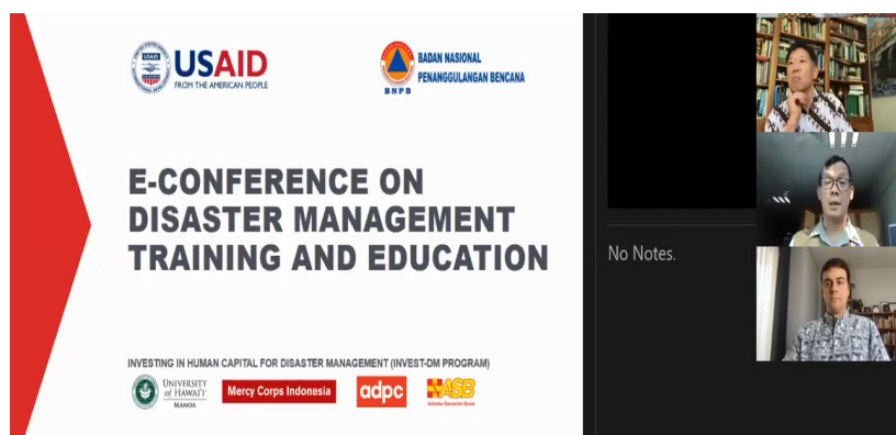
Photo of e-conference on July 27, 2020 (Style: Mercy Corps Indonesia)

"...The partnership opportunity between BNPB, University of Hawaii, and the NDPTC should be initiated and implemented immediately, both in improving the quality of education and preparation to establish the PB BNPB Polytechnic as the leading institution in Southeast Asia for the next decade".