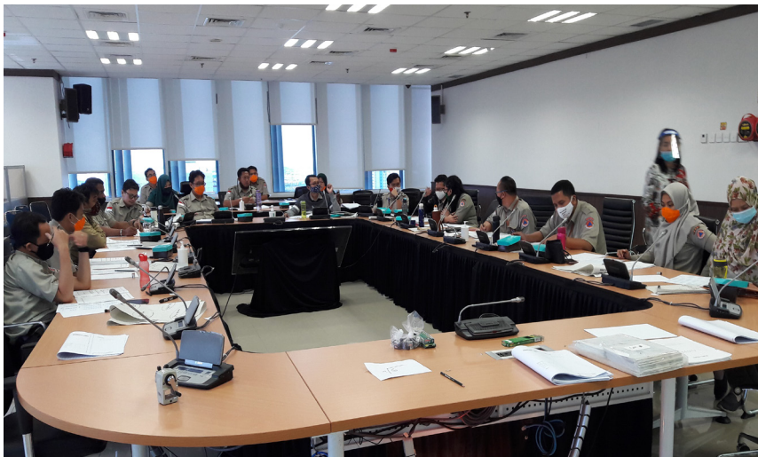
BNPB's Echelon 4 Civil Servants and Staff in the INVEST-DM 'Assessment Center' supported program (Style: Mercy Corps Indonesia)