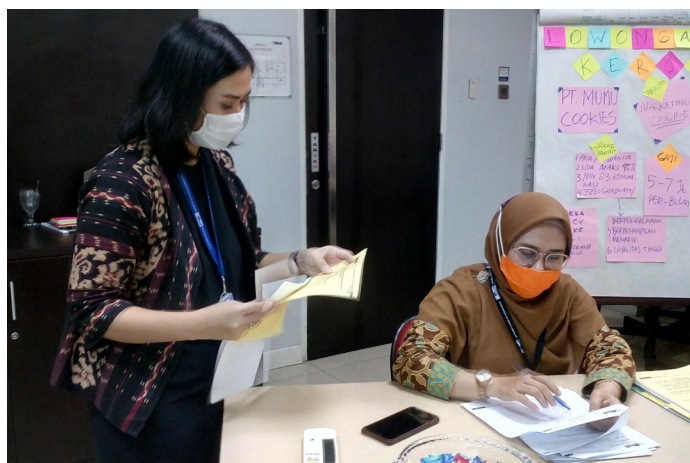
Simulation of "Recruitment and Selection" with guidance from the facilitator (Style Mercy Corps)

Armed with new knowledge and skills, the six HRM graduates are now expected to apply it in the workplace in line with the guiding principles of BNPB's HR bureaucratic reform agenda. Its application includes mapping the career patterns of BNPB civil servants, talent management, as well as structural and functional official positions. The reform agenda also covers CPNS (Civil Servant Candidates) and PPNNP (Non-Civil Servant Government Employees) planning and recruitment, needs assessment, staff development, coaching, effective performance appraisal system, and job descriptions.