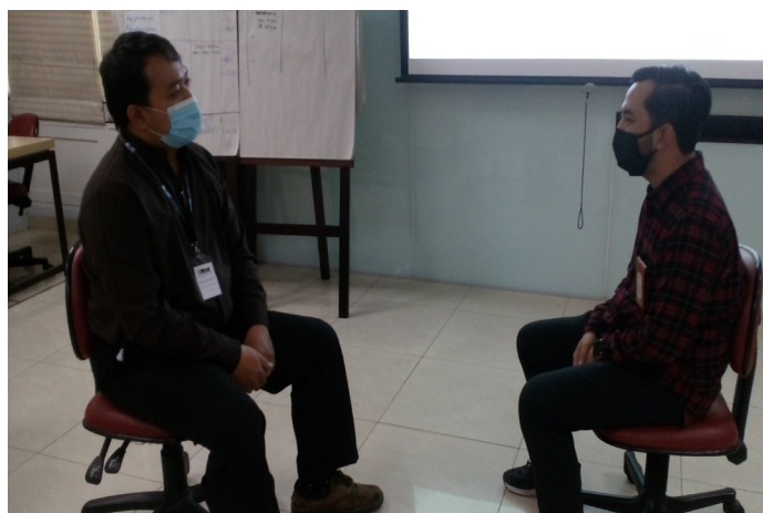
Role-play between superiors and staff in conducting "Performance Appraisal"